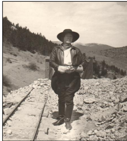
Left: the Gold Woman of Colorado. Below: 1939s publicity portrait.